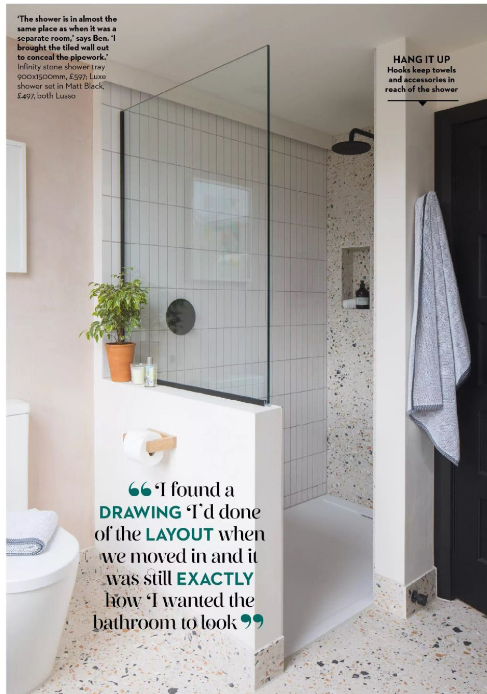
HANG IT UP Hooks keep towels and accessories in reach of the shower

'The shower is in almost the same place as when it was a separate room,' says Ben. 'I brought the tiled wall out to conceal the pipework.' Infinity stone shower tray 900x1500mm, £597; Luxe shower set in Matt Black, £497, both Lusso