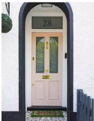
▲ The front door is the perfect welcome for guests, as it's in the family's favourite colour which features throughout their home

They were drawn to the garden and additional space in the double-storey side extension, which had a large main bedroom