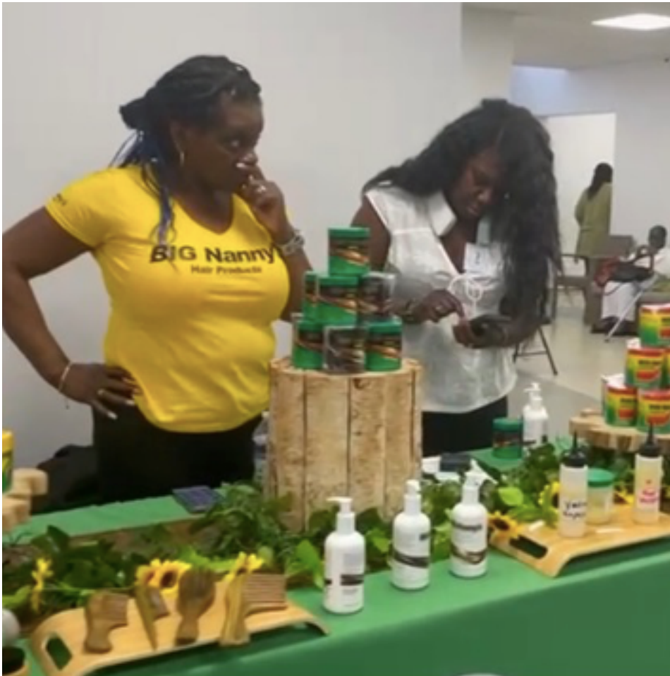
BIG Nanny's Hair Products stall at the C & Hair Conference