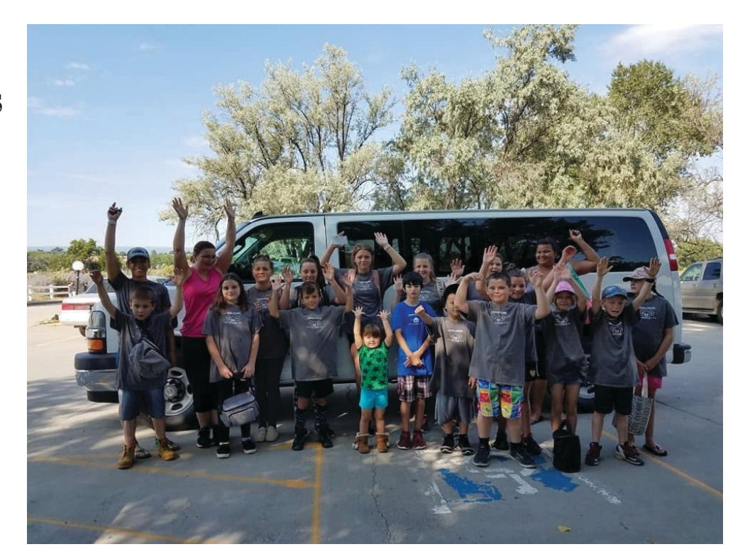
The children of Haven House celebrate a newly donated, 2017 passenger van that is used to take residents on outings and to meet other transportation needs.

other entities. "We're pretty excited about what might