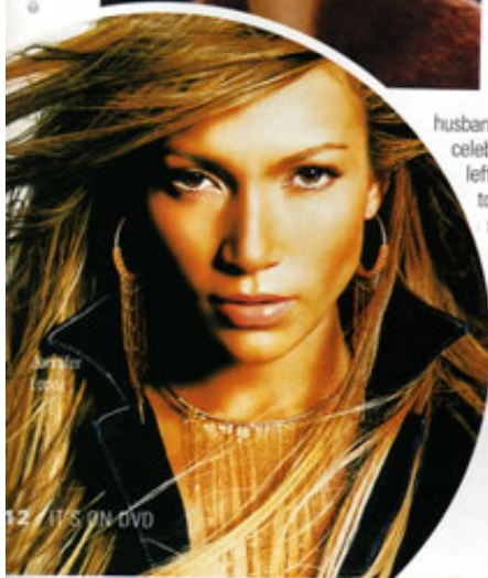
12 IT'S ON DVD