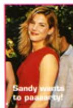
Sandy wants to party!

Y'know how Sandra Bullock got on like a house on fire with Keanu in Speed ? Well she's currently shooting Speed 2 , but hasn't hit it off with sexy co-star Jason Patric. I hear she organises groups to go partying, but he always retreats to his trailer come nightfall. Maybe she should try a Clooney-type prank to get Jase in the mood!