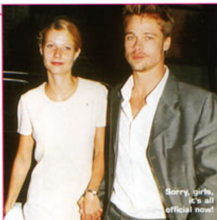
Sorry, girls, it's all official now!

Gwyneth Paltrow, shopping for wedding rings in ritzy Beverly Hills. The casually-dressed love-birds were all hot 'n' heavy, kissing and holding hands as they spent two hours trying on rings in Cartier jewellers on trendy