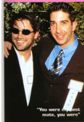
"You were my best mate, you were!"

Friends' David Schwimmer was so heartbroken when he couldn't find his ultra-expensive leather coat, he rang designer Giorgio Armani to get another one. But when he wore his new jacket to work, he was shocked to find Matt LeBlanc sporting one exactly the same! "Hey man, that's just like mine," David whined. "That's 'cause it is yours," replied Matt. He'd borrowed it two months ago and forgotten to return it!