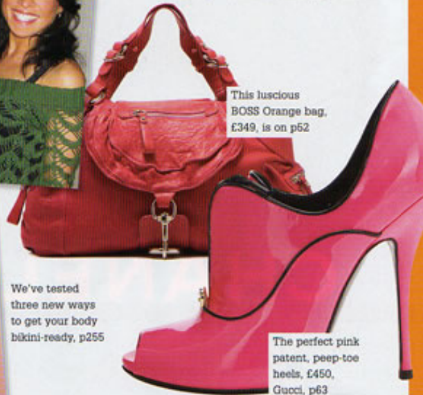
This luscious BOSS Orange bag, £349, is on p52