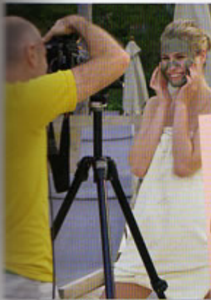
David Ward in Thailand, shooting our summer beauty story, p188