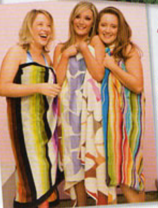
We've tested three new ways to get your body bikini-ready, p255