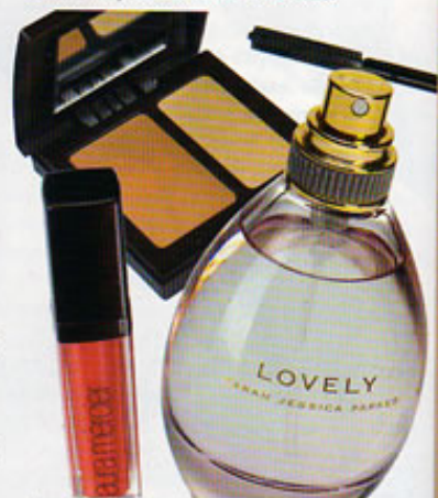
Laura Mercier Secret Camouflage, £25; Rimmel London Glam Eyes mascara, £6.99; SJP Lovely EDP, £39 (100ml); Laura Mercier Lip Plumper in Pink Grapefruit, £24

'It's not easy getting older, but luckily the industry is starting to acknowledge the power and beauty of women in their forties and beyond. Besides, I really do believe that beauty shines from the inside.'