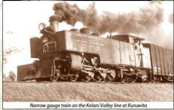
Narrow gauge train on the Kelani Valley line at Kuruwita