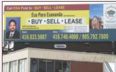
Esra on Billboard at Major Intersections in Toronto and Greater Toronto Area

Free Market Evaluation Free Home Staging Consultation Feature Sheet / Slide Show Property listed in MLS Website etc. Open House Until Sold Regular Feed Back 1% When you sell thru Esra 3.5% When Esra sells thru Cooperating Broker Up to $4,500.00 Savings when you sell your house worth $300,000 thru Esra