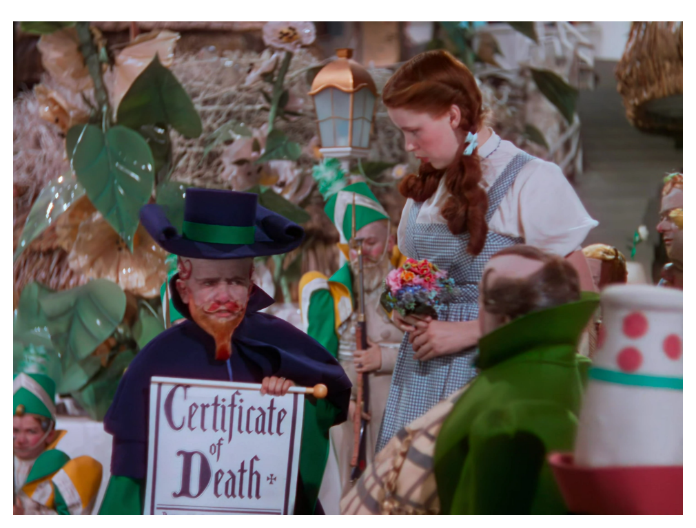
"Ding, dong, the witch is dead!" The Wizard of Oz

"You and your husband hold hands as, with a flick of an orange switch, the physician sentences your child to death."