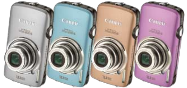
IXUS 200 IS (Available in Blue, Gold, Purple, Silver)