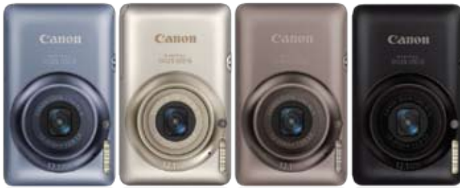
IXUS 120 IS (Available in Black, blue, brown or silver)