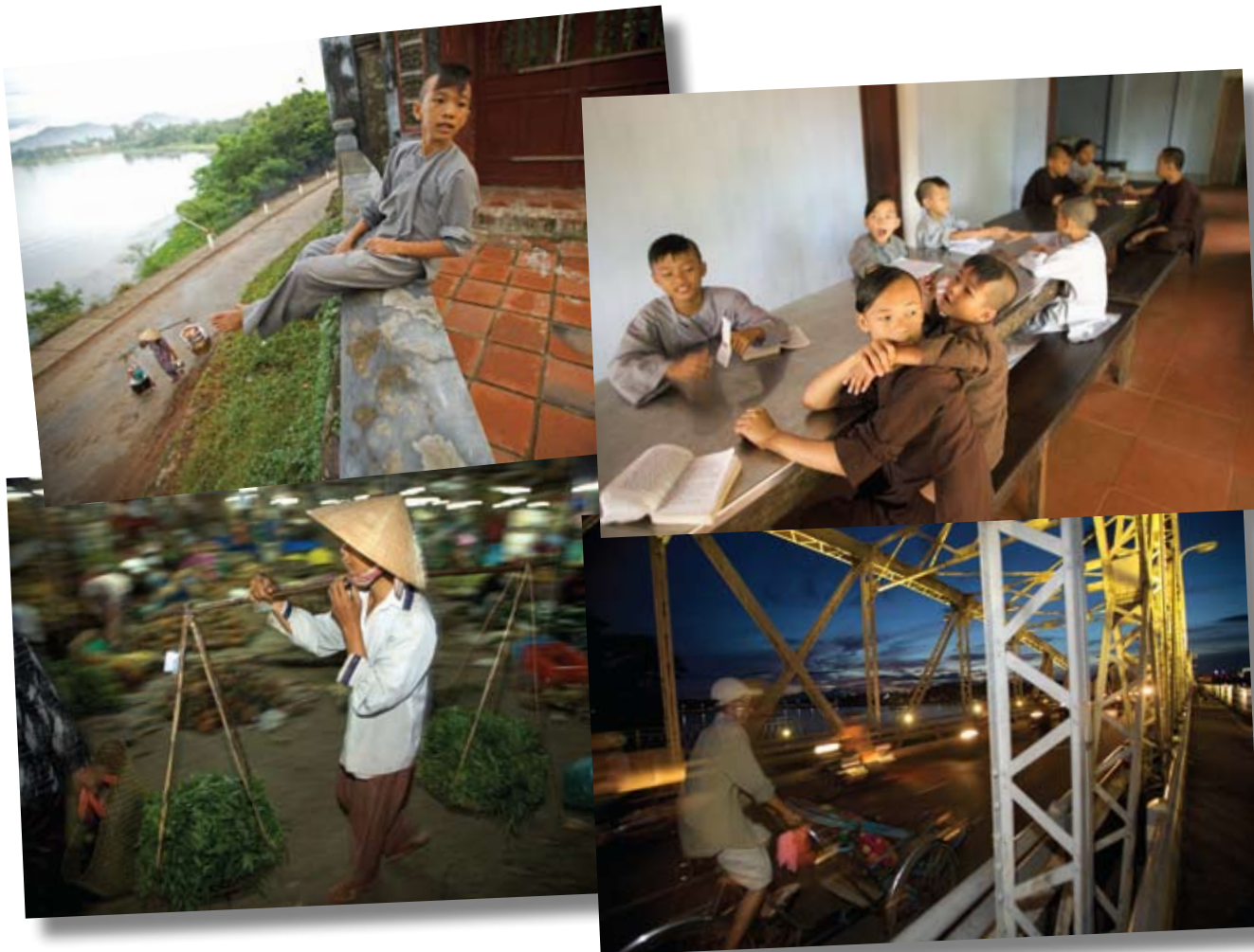
All images shot by Kris LeBoutillier with Canon EOS 5D Mk II.