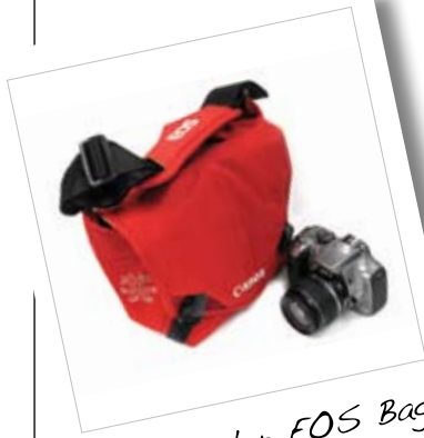
Crumpler EOS Bag