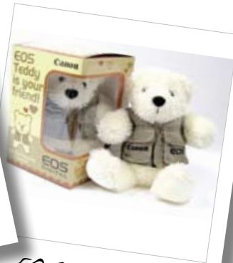
EOS Soft Bear