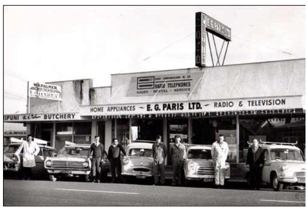
The original location (now pac n save)

As the washing machine market changed Ted took a bold step and started Wairarapa's first computer bureau processing facility. This required a huge investment in computer equipment, equipment that took up a whole room, had hard disk drives the size of fridges and were a lovely brown colour.