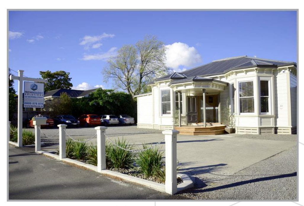
Our new custom built premises in Victoria Street, Masterton

We are committed to ensuring that our often very busy technical team is resourced appropriately for the ultimate benefit of our clients.