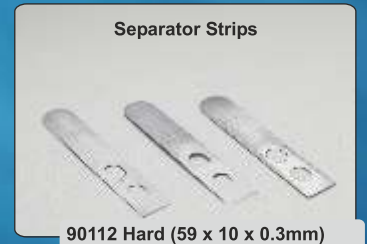
Separator Strips 90112 Hard (59 x 10 x 0.3mm) 90113 Medium (59 x 10 x 0.2mm) 90114 Soft (59 x 10 x 0.1mm)