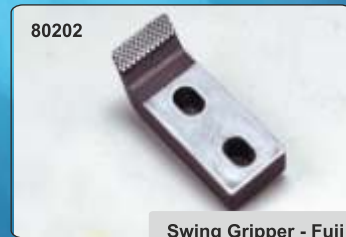
Swing Gripper - Fuji