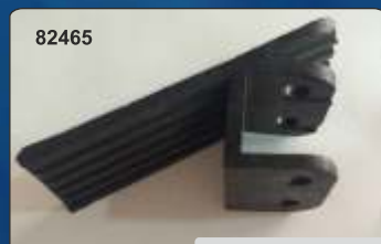
82465 Paper Supporter Muller Martini