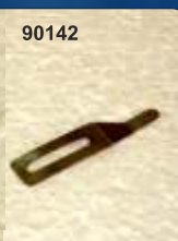
90142 Separator Strips Bend Mitsubishi