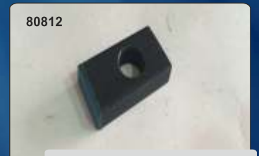
80812 Impression Cylinder Pad 19 x 30mm. Mitsubishi 28" x 40"