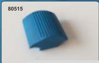
80515 Chain Delivery Pad Tip Akiyama 16X16X8mm Thick