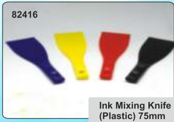
82416 Ink Mixing Knife (Plastic) 75mm