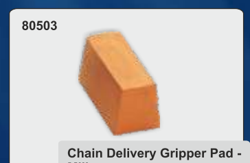
Chain Delivery Gripper Pad - Miller