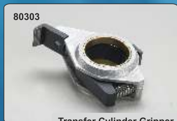
Transfer Cylinder Gripper - Mitsubishi - Daya