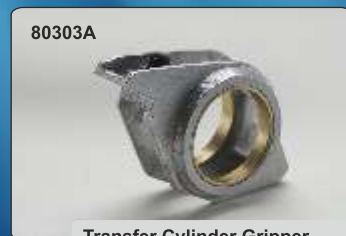
Transfer Cylinder Gripper Tip Holder - Mitsubishi - Daya