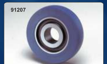
91207 Forwarding Runner 80MM