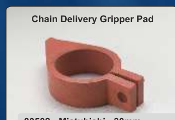
80502 - Mistubishi - 30mm 80504 - 30mm (Rubber) Mitsubishi