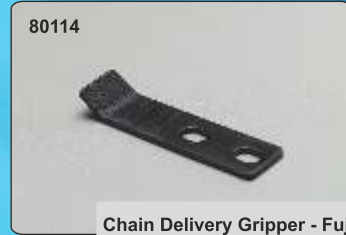
Chain Delivery Gripper - Fuji