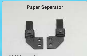
Paper Separator 90123 Hard 90124 Soft