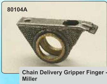
Chain Delivery Gripper Finger - Miller