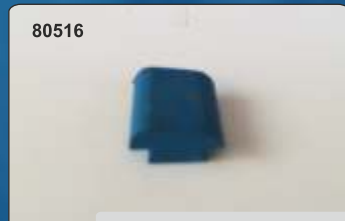
80516 Chain Delivery Pad Tip Akiyama 15X12X6mm Thick