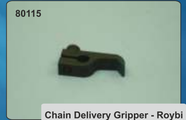
Chain Delivery Gripper - Roybi