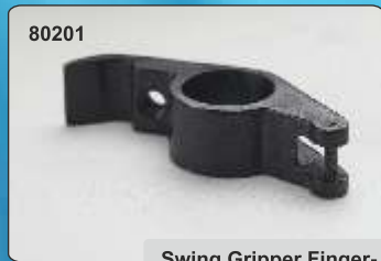
Swing Gripper Finger - Casted Miller M/C