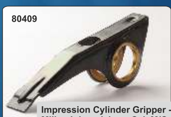
Impression Cylinder Gripper - Miller Johennisberg Cyl. M/C