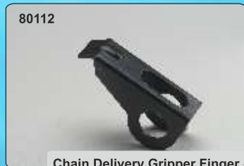
Chain Delivery Gripper Finger - Mitsubishi 20 x 28