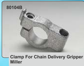
Clamp For Chain Delivery Gripper - Miller