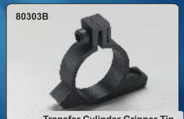
Transfer Cylinder Gripper Tip - Mitsubishi - Daya