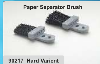
Paper Separator Brush 90217 Hard Variant 90218 Soft Variant