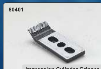
Impression Cylinder Gripper - Fuji