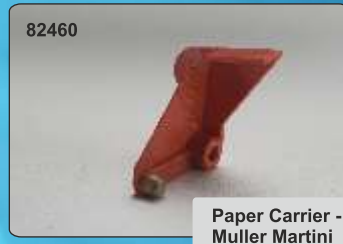
82460 Paper Carrier - Muller Martini