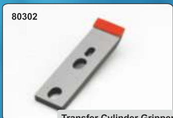
Transfer Cylinder Gripper (Rubber Tip) - Akiyama