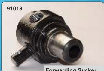
91018 Forwarding Sucker Assembly - Mitsubishi