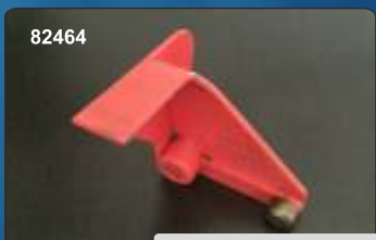
82464 Paper Carrier - Right Muller Martini