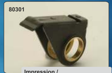
Impression / Transfer Gripper Finger - Shiva