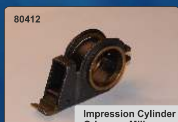
Impression Cylinder Gripper - Miller