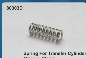
Spring For Transfer Cylinder Gripper Clamp - Mitsubishi - Daya