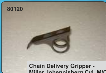
Chain Delivery Gripper - Miller Johennisberg Cyl. M/C