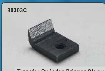
Transfer Cylinder Gripper Clamp - Mitsubishi - Daya