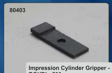
Impression Cylinder Gripper - ROYBI - 500