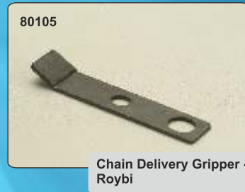
Chain Delivery Gripper - Roybi