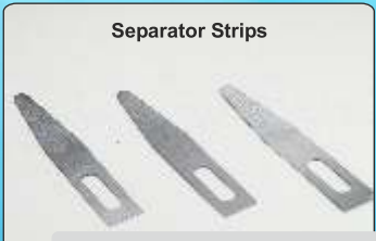
Separator Strips 90115 Hard (76 x 12 x 0.3mm) 90116 Medium (76 x 12 x 0.2mm) 90117 Soft (76 x 12 x 0.1mm)