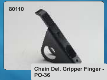
Chain Del. Gripper Finger - PO-36