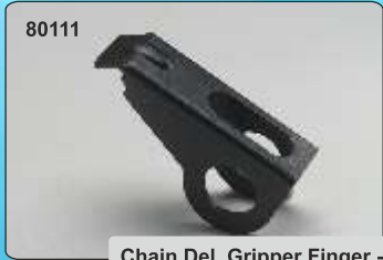
Chain Del. Gripper Finger - Mitsubishi 4DP- 28 X40