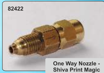
82422 One Way Nozzle - Shiva Print Magic