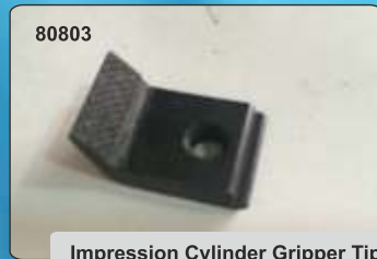
80803 Impression Cylinder Gripper Tip Mitsubishi 20" x 28"