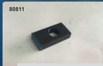
80811 Impression Cylinder Pad 15 x 30mm. Mitsubishi 20" x 28"