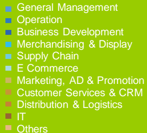
By Job Function

Retail Innovation Asia Virtual Conference 2021 is the Only strategic leaders' and decision makers' summit that unites all major stakeholders in Southeast Asia retail and eCommerce community. It is dissect the current performance, trends, innovations, strategies and best practices for retailers to adopt to the new normal, stay resilient and gain long term competitiveness.