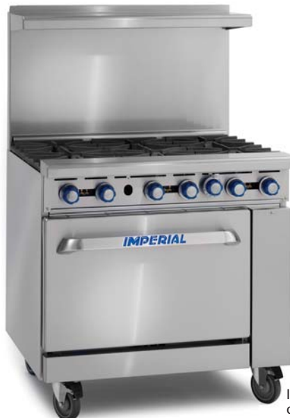
IR-6 shown with optional casters

OPEN BURNERS - PyroCentric™ 32,000 BTU (9 KW) anti-clogging burner with a 7,000 BTU/hr. (2 KW) low simmer feature. Cast iron PyroCentric burners are standard on all IR Series Ranges.