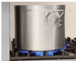
Back grate hot air dam deflects heat onto the stock pot, not the backsplash.