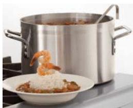
Large 5" (127 mm) stainless steel landing ledge for convenient plating.