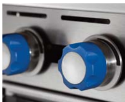
Durable cast aluminum with a vylox heat protection grip.