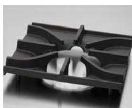
Top grates with anti-clogging pilot shield protect the pilot from grease and debris.