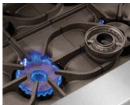
Two rings of flame for even cooking no matter the pan size.