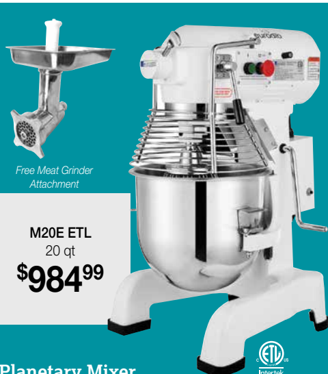
Free Meat Grinder Attachment