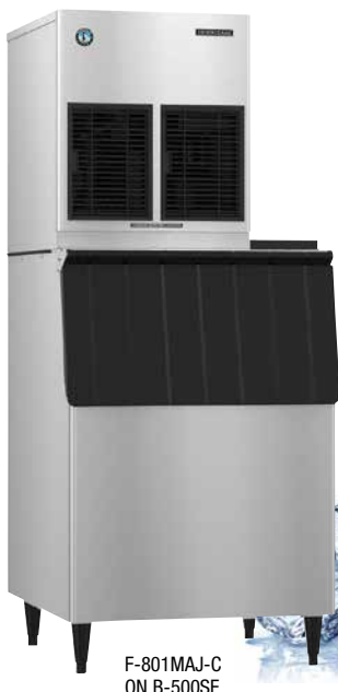
F-801MAJ-C ON B-500SF