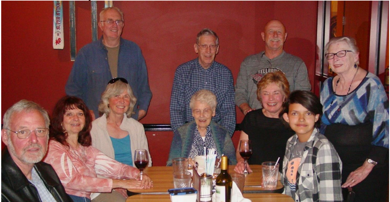
Friday Night Dinner Group at Greenside Restaurant around 2015