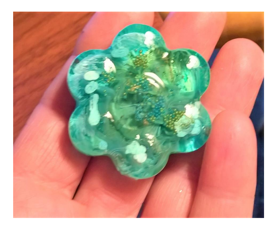
Picture Above: Top of Piece, All Coated in Resin, Bottom Coated With Latex

3. Coat the area that is not painted with latex (top and sides) with resin. Let the resin dry at least 8 hours.