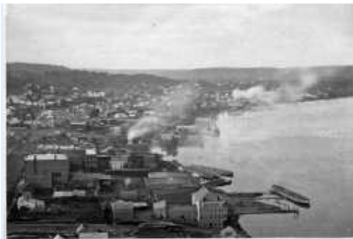
This late 1860s photograph shows barges along Red Wing's Mississippi River waterfront awaiting wheat for shipment to customers downriver.