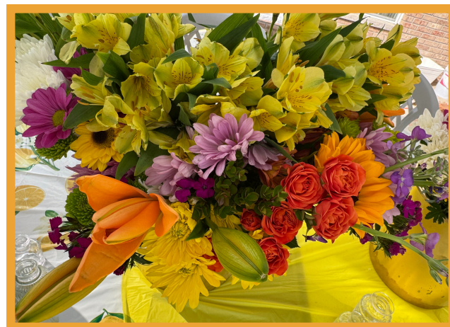
FLOWERS FOR BUILD YOUR OWN BOUQUET AT THE LEMONADE STAND IN JULY

You are a part of the reason that we do what we do.