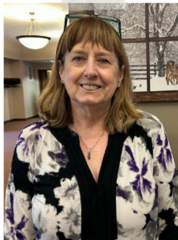
Elaine Transportation Dispatch