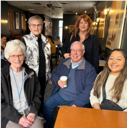
Quarterly Volunteer Coffee Hour at Mandy's Coffee Shop

"I've been riding with Faith in Action for quite awhile now. They have helped bring me to work and back and they have also helped me pick up my medications when needed. They have been pretty diligent. All of the drivers are very nice and always willing to help you just need to tell them what you need. Everyone is happy and they have helped me for about 4 years now. The service has been really awesome".