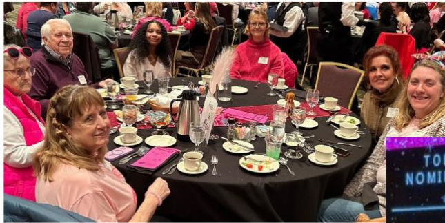
Red Wing Chamber annual meeting and awards event. FIA this year was one of the top 5 nonprofits in Red Wing.