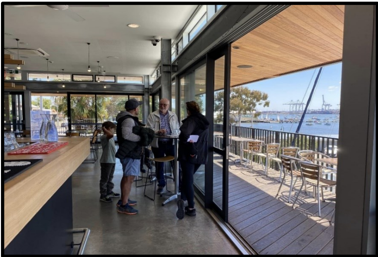
And a great community of members