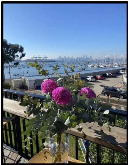
The upstairs balcony has spectacular views of Melbourne

At Hobsons Bay Yacht Club we are proud of our friendly culture and the development of our clubhouse, yard, marina and sailing program since 1888. The upstairs bar area features stunning views of the Melbourne City skyline. Birthday Parties, Engagements, Small Weddings, Wakes, and Business & Corporate functions can all be accommodated.