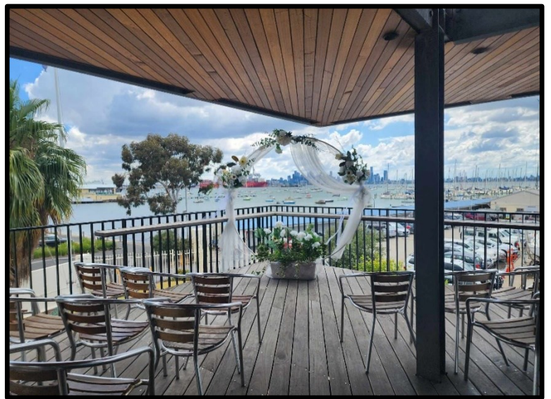
A beautiful wedding venue