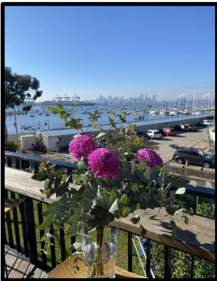
The upstairs balcony has spectacular views of Melbourne

At Hobsons Bay Yacht Club we are proud of our friendly culture and the development of our clubhouse, yard, marina and sailing program since 1888. The upstairs bar area features stunning views of the Melbourne City skyline. Birthday Parties, Engagements, Small Weddings, Wakes, and Business & Corporate functions can all be accommodated.