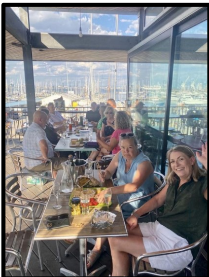
With sizable outdoor seating also available