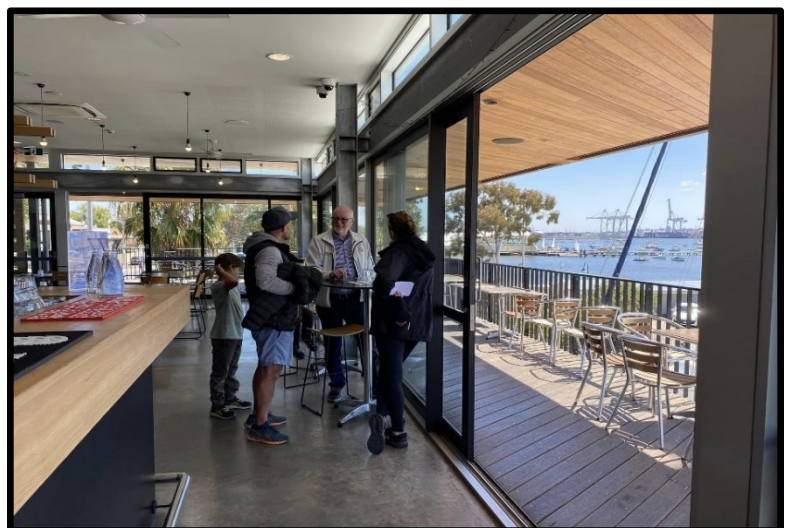
And a great community of members