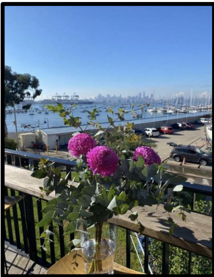
The upstairs balcony has spectacular views of Melbourne

At Hobsons Bay Yacht Club we are proud of our friendly culture and the development of our clubhouse, yard, marina and sailing program since 1888. The upstairs bar area features stunning views of the Melbourne City skyline. Birthday Parties, Engagements, Wakes, and Business & Corporate functions can all be accommodated.