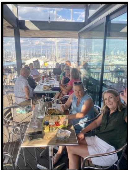
With sizable outdoor seating also available