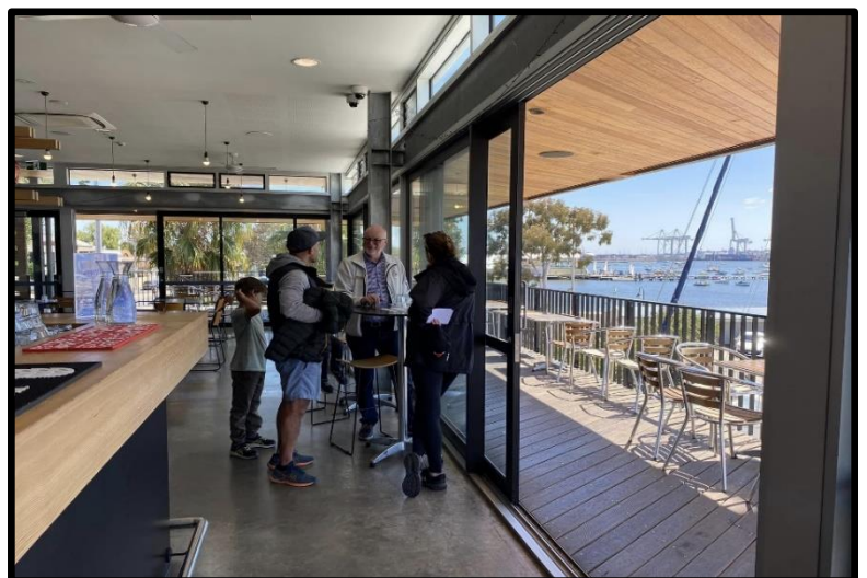
And a great community of members