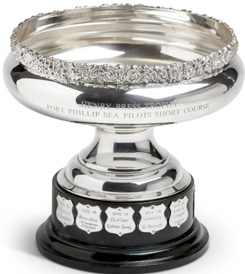
HENRY PRESS TROPHY 1 ST HBYC BOAT IN THE HENRY PRESS TROPHY RACE (PHS)