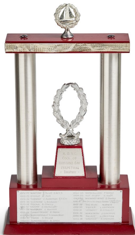
COCK OF HOBSONS BAY TROPHY 1 ST HBYC BOAT IN FIRST SUMMER PURSUIT OF THE YEAR