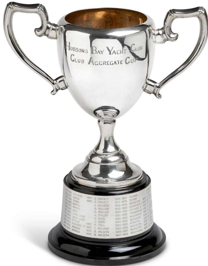
CLUB AGGREGATE TROPHY 1 ST HBYC BOAT IN CLUB AGGREGATE (PHS)