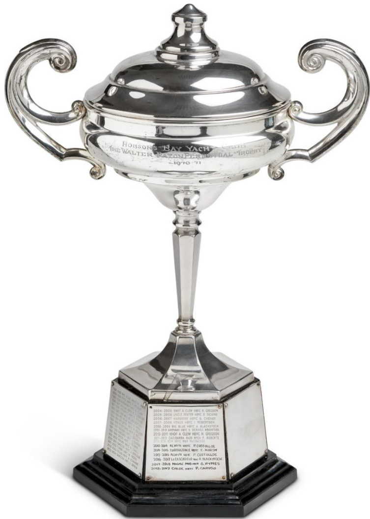
WALTER PATON PERPETUAL TROPHY 1 ST HBYC BOAT IN PORTARLINGTON PASSAGE RACE (PHS)