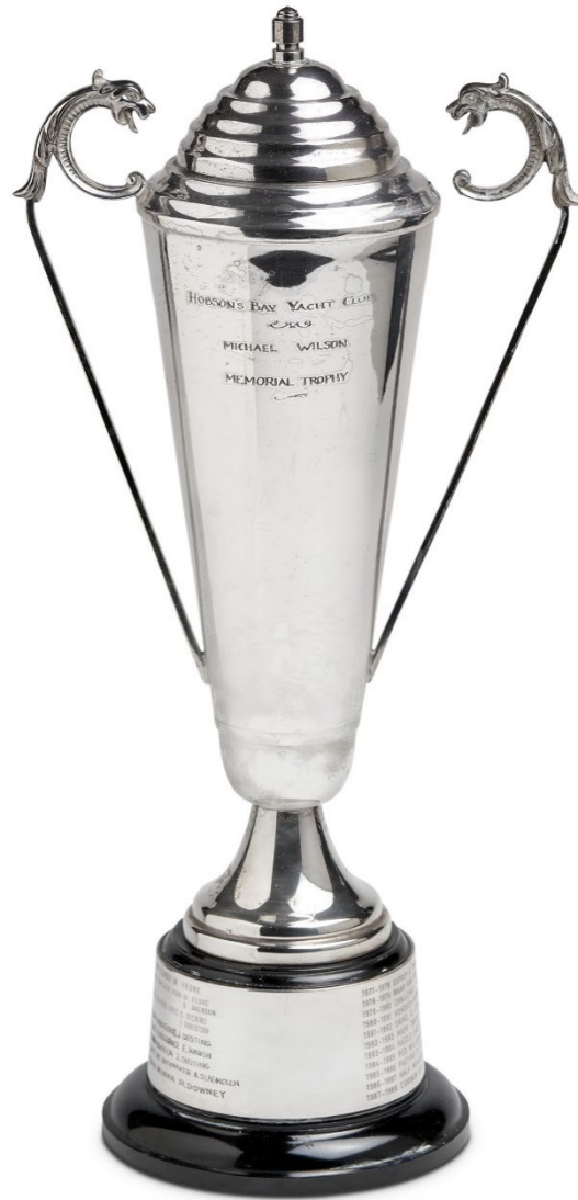
MICHAEL WILSON TROPHY 1ST HBYC BOAT IN ST LEONARDS PASSAGE RACE (AMS)