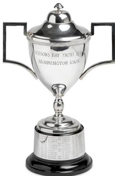
MORNINGTON CUP 1 ST HBYC BOAT IN THE MORNINGTON PASSAGE RACE (PHS)