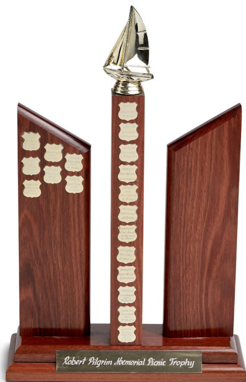
ROBERT PILGRIM MEMORIAL PICNIC TROPHY LAST SUMMER PURSUIT RACE AT END OF THE YEAR