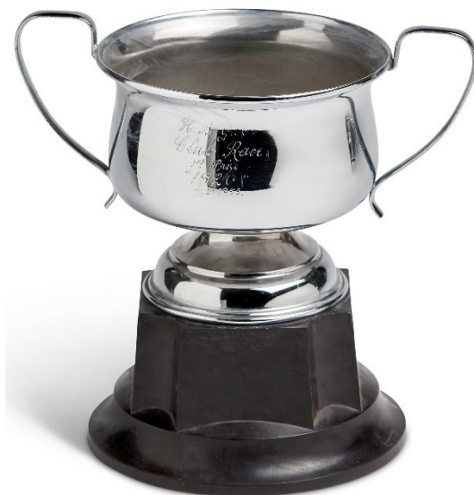
CLUB RACE TROPHY 1 ST HBYC BOAT IN THE MORNINGTON PASSAGE RACE (AMS)