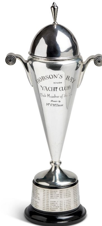
CLUB MEMBER OF THE YEAR TROPHY 1 ST HBYC BOAT IN THE WYNDHAM HARBOUR PASSAGE RACE (PHS)