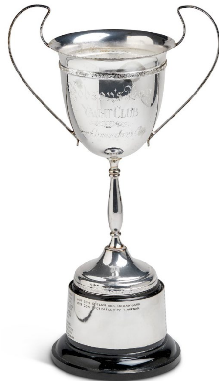
REAR COMMODORES CUP LAST CLUB AGGREGATE RACE IN MARCH