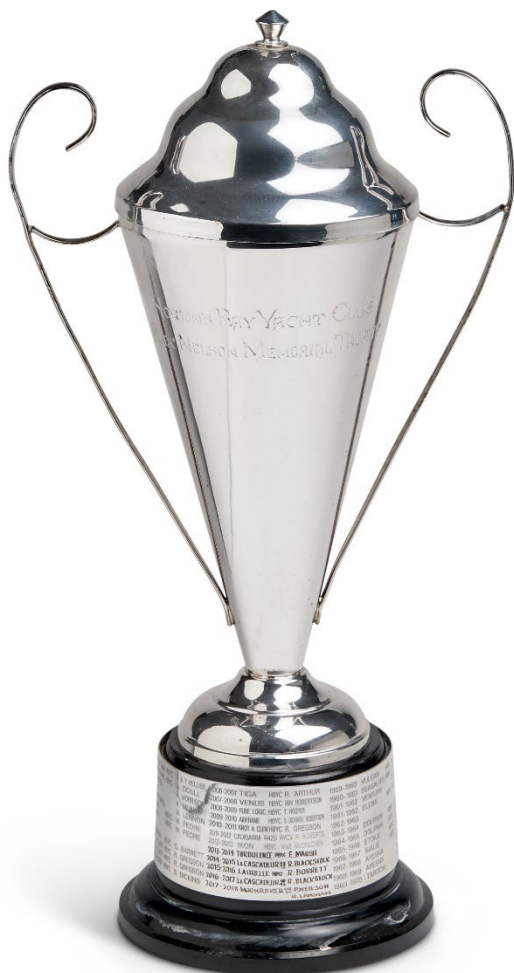
ALEC NELSON TROPHY 1 ST HBYC BOAT IN PORTARLINGTON PASSAGE RACE (AMS)