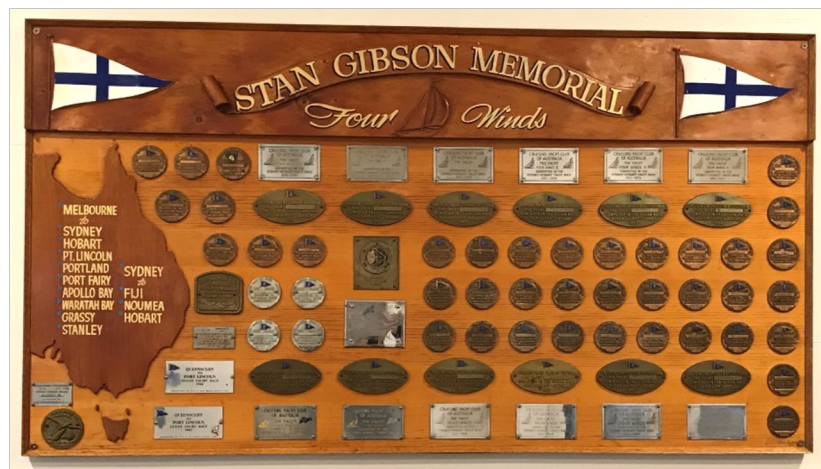
STAN GIBSON MEMORIAL TROPHY FIRST HBYC IN SECOND RACE TO PORTARLINGTON (PHS)