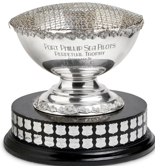
PORT PHILLIP SEA PILOT'S TROPHY