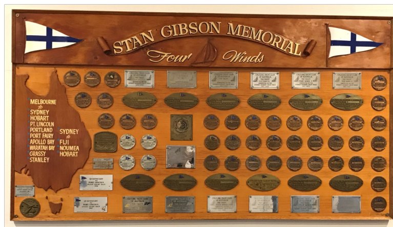
STAN GIBSON MEMORIAL TROPHY FIRST HBYC IN SECOND RACE TO PORTARLINGTON (PHS)