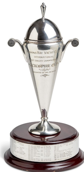
ACROSPIRE CUP 1 ST HBYC BOAT IN FIRST TWO-HANDED RACE SERIES (PHS)