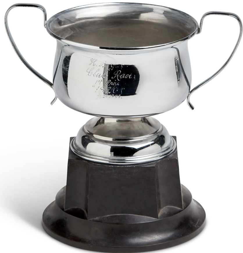
CLUB RACE TROPHY 1 ST HBYC BOAT IN THE MORNINGTON PASSAGE RACE (AMS)