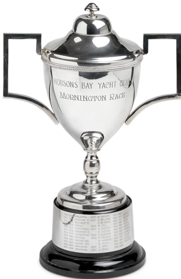
MORNINGTON CUP 1 ST HBYC BOAT IN THE MORNINGTON PASSAGE RACE (PHS)