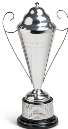
ALEC NELSON TROPHY 1 ST HBYC BOAT IN PORTARLINGTON PASSAGE RACE (AMS)