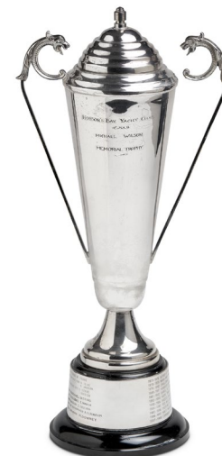
MICHAEL WILSON TROPHY 1 ST HBYC BOAT IN ST LEONARDS PASSAGE RACE (AMS)