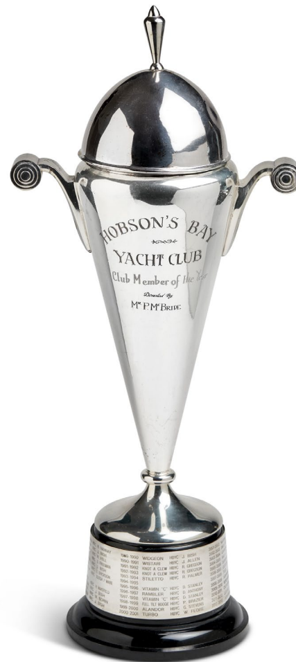
CLUB MEMBER OF THE YEAR TROPHY 1 ST HBYC BOAT IN THE WYNDHAM HARBOUR PASSAGE RACE (PHS)