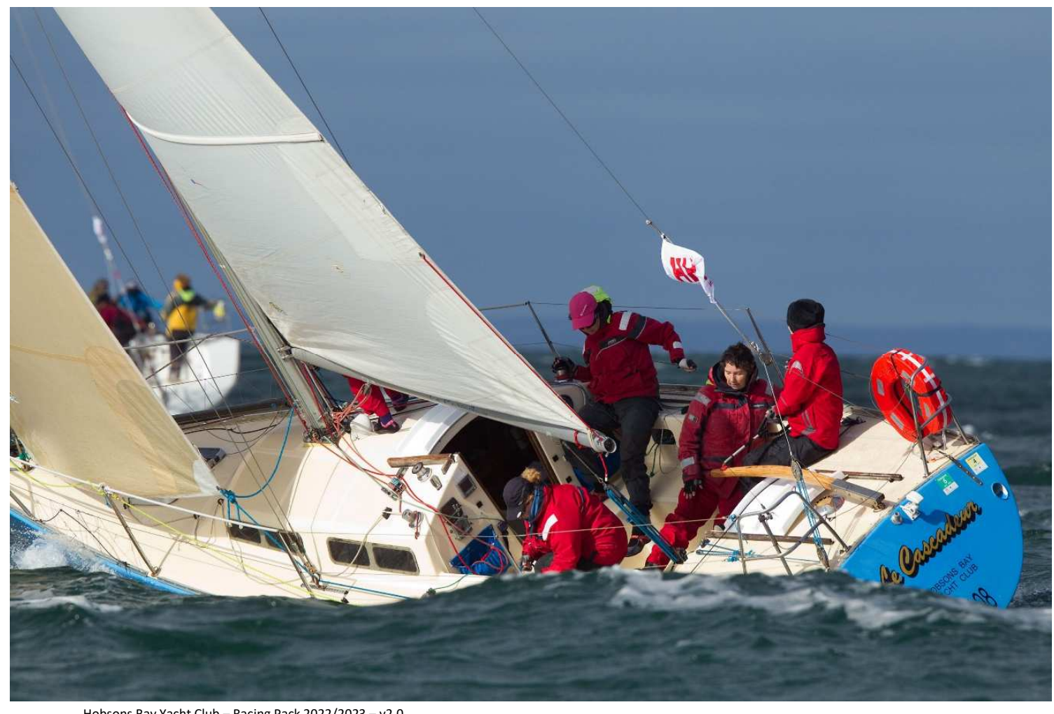
Hobsons Bay Yacht Club – Racing Pack 2022/2023 – v2.0