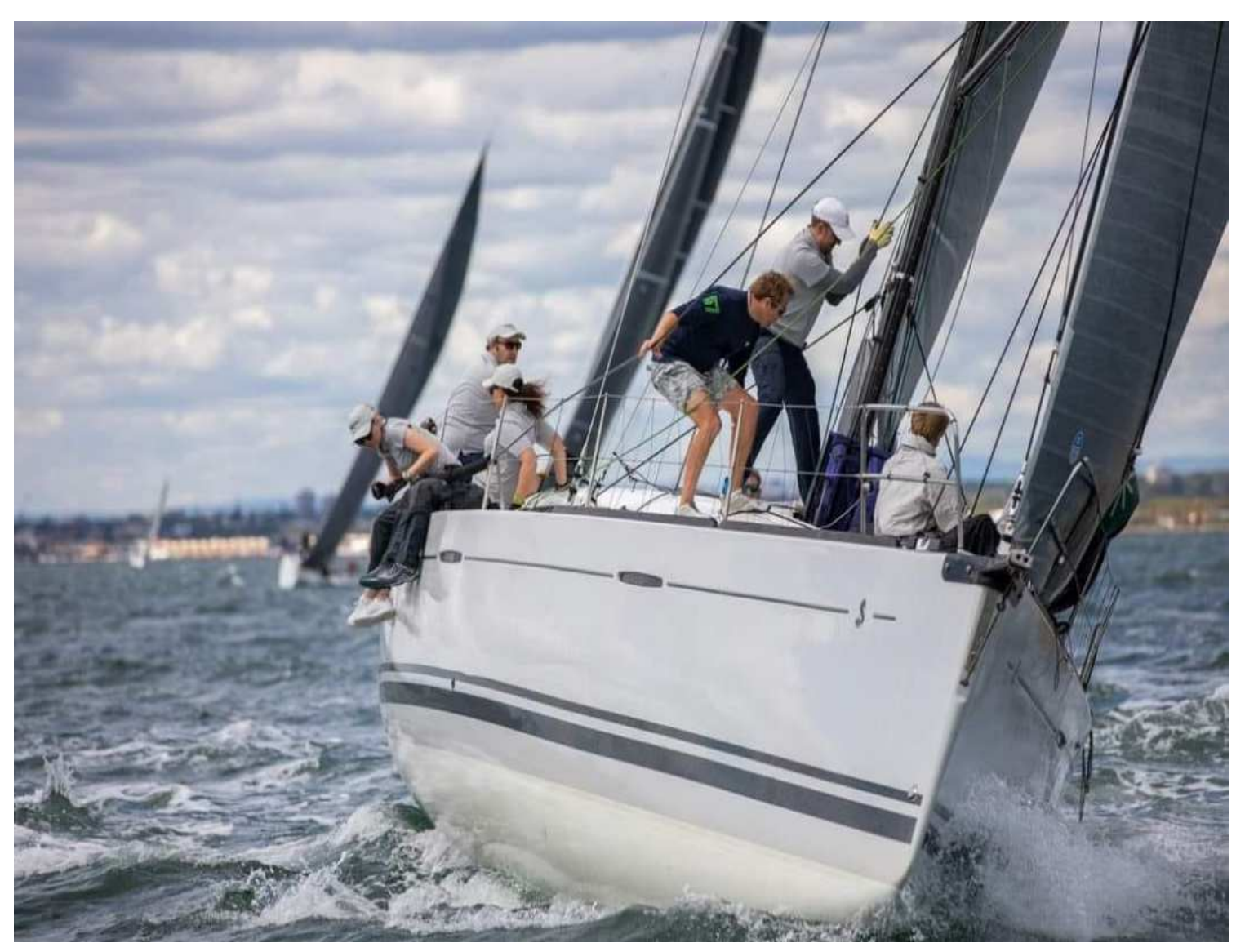
Hobsons Bay Yacht Club – Racing Pack 2022/2023 – v2.0