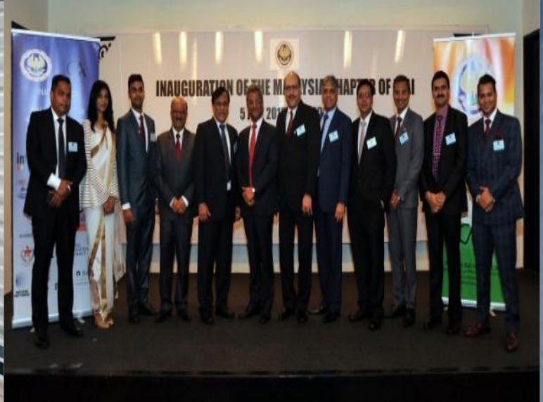
MEETING WITH IHC 2021 AND OPENING CEREMONY 2018