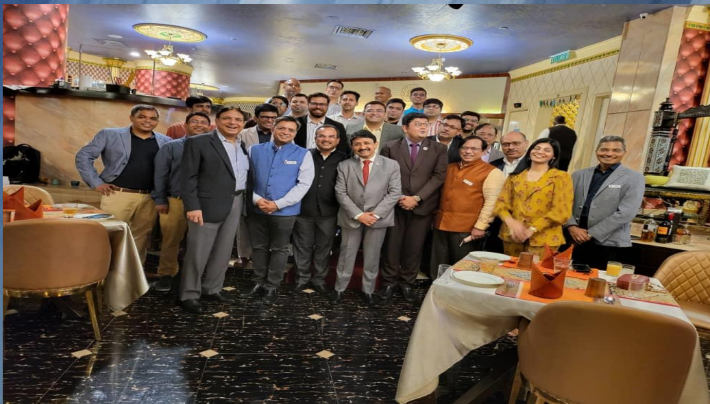
MEMBERS MEET & GREET ICAI PRESIDENT & VP – JULY 2022, SHERATON KL