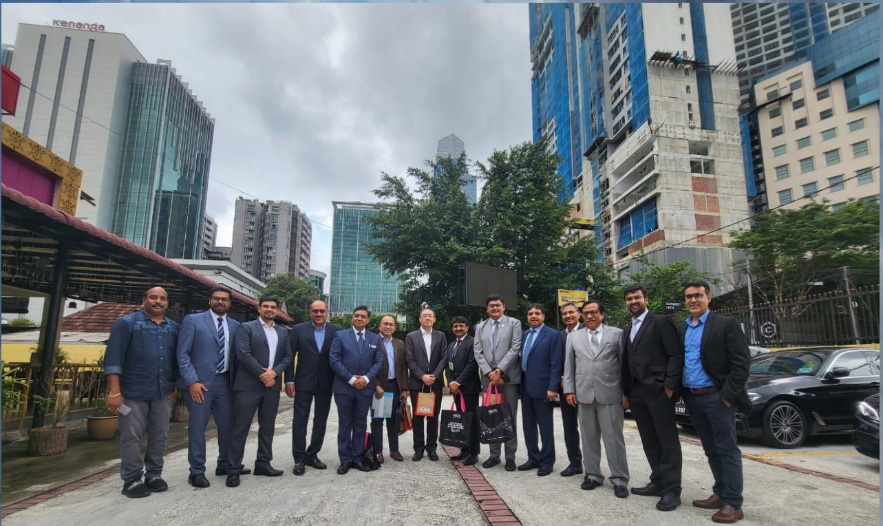
MEETING WITH MICPA AND ICAI – JULY 2022, SPICE KL