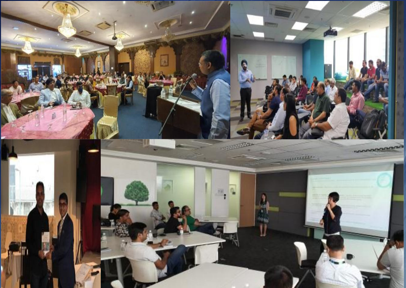
VARIOUS CPE MEETINGS OF CHAPTER