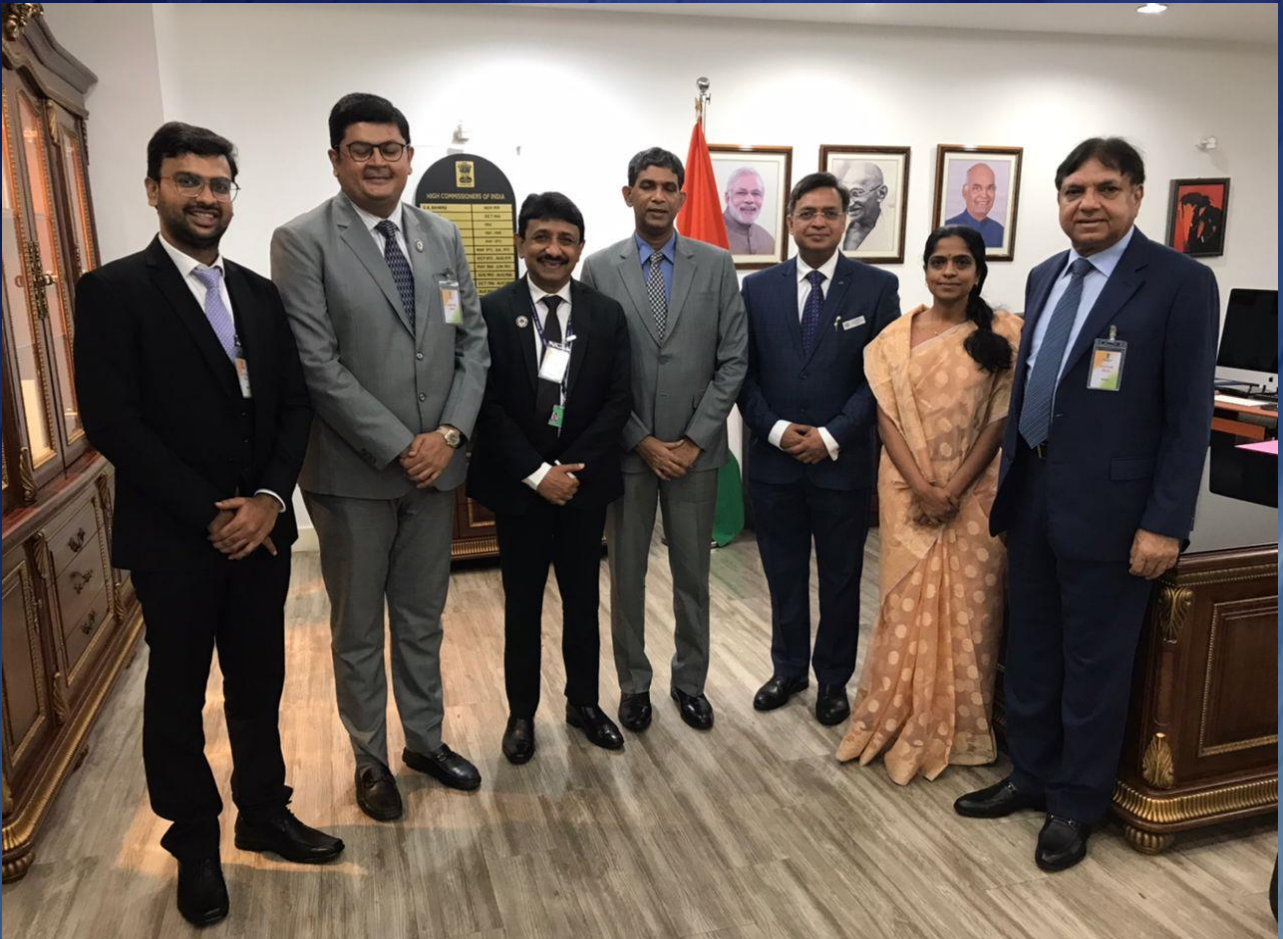
MEETING WITH IHC, ICAI PRESIDENT AND VP – JULY 2022, IHC OFFICE