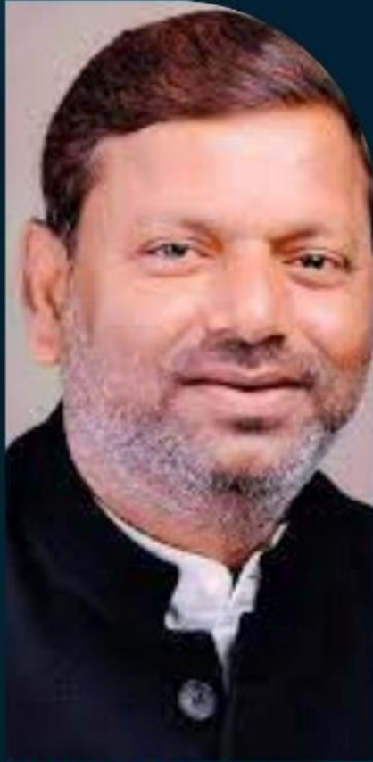
SHRI PANKAJ CHAUDHARY CHIEF GUEST & HONORARY SPEAKER

JOIN US FOR SPECIAL SESSION BY SHRI PANKAJ CHAUDHARY, MINISTER OF STATE IN MINISTRY OF FINANCE, GOI