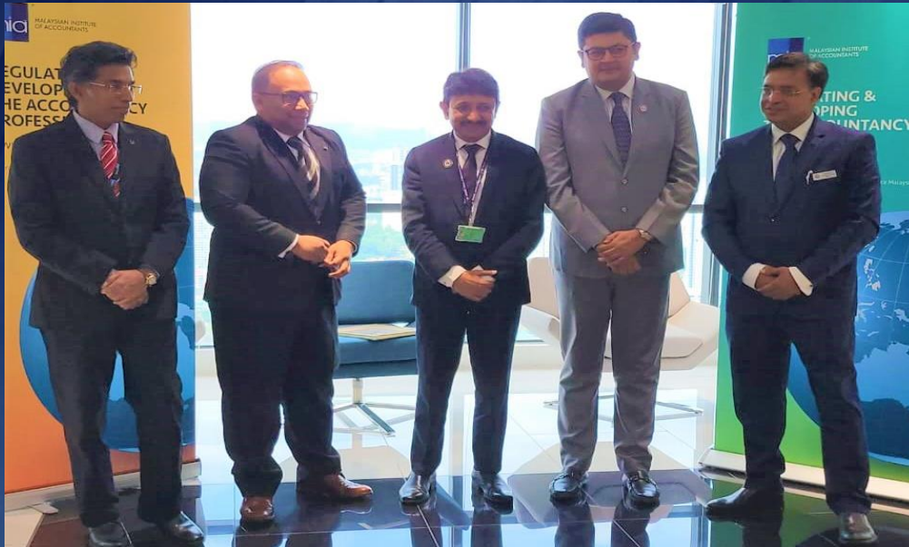
MEETING WITH MIA AND ICAI – JULY 2022, MIA OFFICE KL