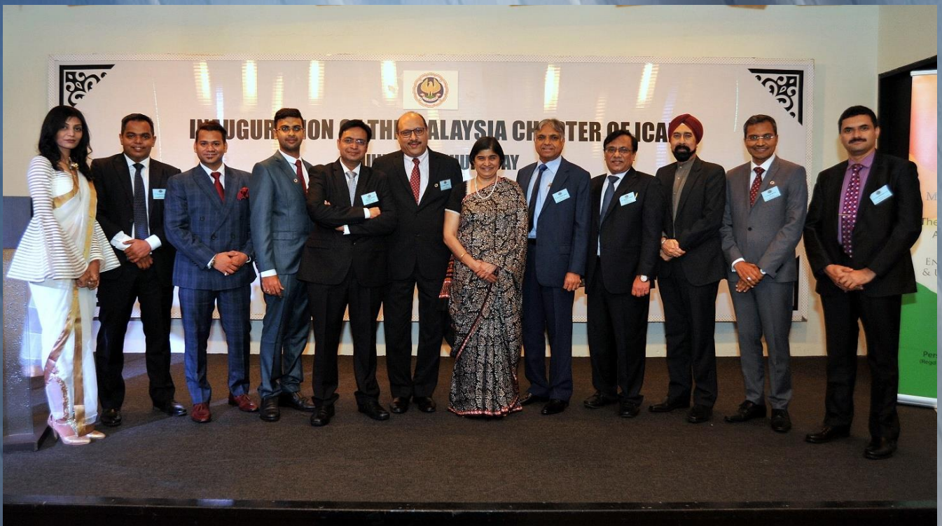
OPENING CEREMONY OF CHAPTER, 2018, TPC KL