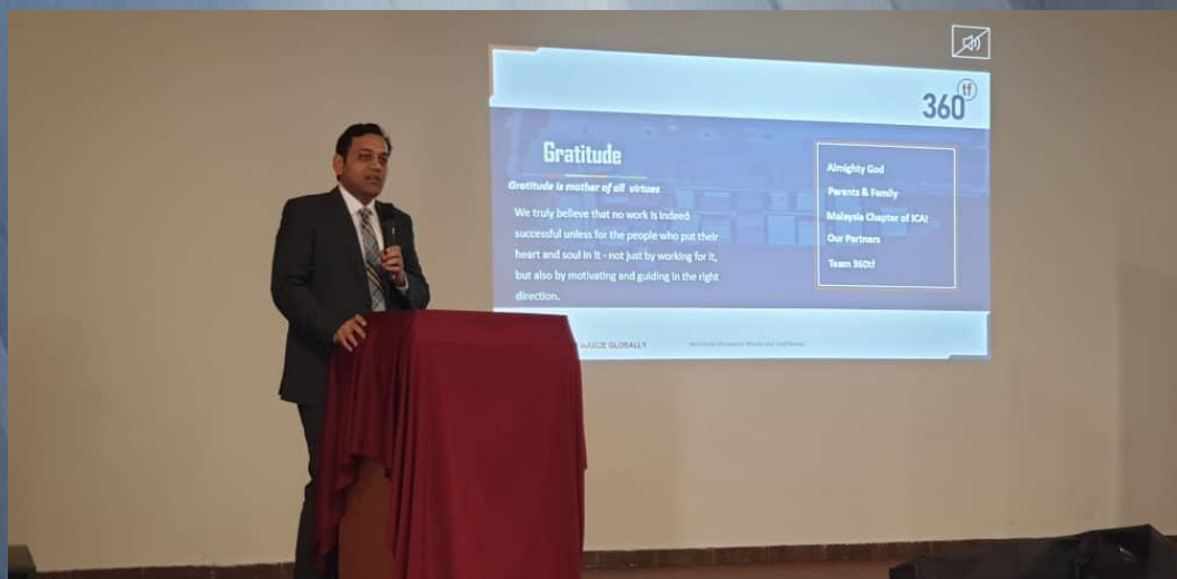
CPE EVENT BY 360 TF PLATINUM SPONSORS OF MICAI