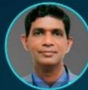
H.E. B.N. REDDY High Commissioner of India to Malaysia INAUGURATION