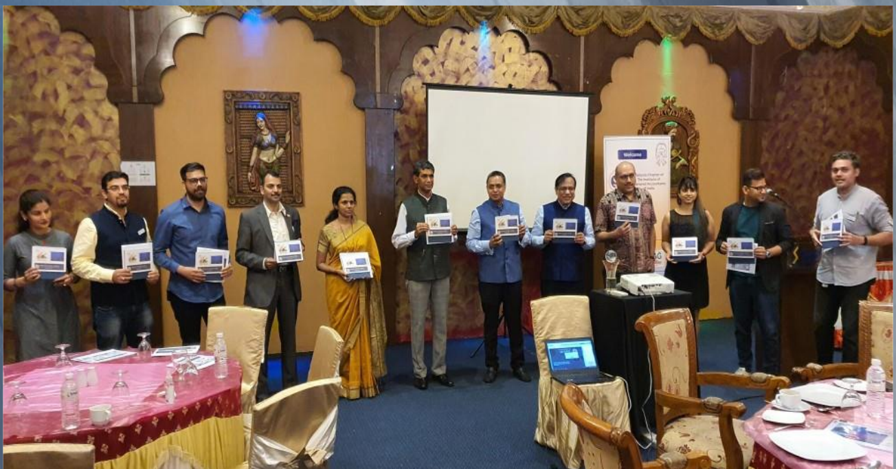
CALENDAR LAUNCH EVENT BY IHC, 2022