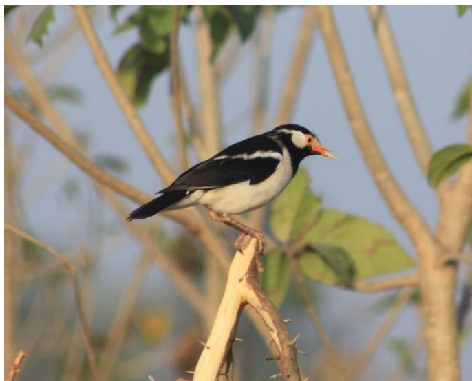
Asian pied starling (G. contra) in Vadnagar town of northern part of Gujarat (N 23.7896, E 72.6291)

India has more than 1300 bird species, which is about 12.5% of world's total avifauna (Grimmett et al. 2011). Among them, a total of 576 bird species have been reported from Gujarat state (Ganpule, 2016). Asian pied starling ( Gracupica contra ) commonly found in foothills of south Asia until elevation of 700m. It is also commonly found near water bodies of human dominated areas, grasslands and farmland (Ali & Ripley, 1983). Ali & Ripley (1983) recorded three subspecies of Pied starling in India, whereas Grimmett et al. (2005) mentioned only two subspecies of Asian pied starling in India; viz. G. superciliaris , observed around Manipur only while, G. contra is widely observed in North, central and Eastern parts of India (Grimmett et al. 2005). Monga & Naoroji (1983) mentioned sighting of pied starling in Jamnagar and south Gujarat as rare/vagrant. Presence and breeding of G. Contra was also reported from Rajkot and Dahod districts of Gujarat consequently (Rasmussen & Anderton, 2005; Ganpule, 2016) this species was introduced in Mumbai of Maharashtra state, India (Rasmussen & Anderton, 2005).