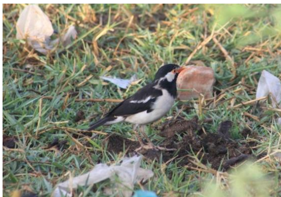
Asian pied starling (G. contra) perching on electric wire above the agriculture farm (N 23.8831 E 72.6109)

observed for 10 minutes and its behaviour was recorded. Bird was feeding on some unknown excreta material while foraging with other bird species viz., Glossy ibis ( Plegadis falcinellus ), Streak-throated swallow ( Petrochelidon luvicola ). Another individual of the same species pair was observed on April 5, 2021, 16:13 hrs at Kheralu town, approximately 11 km far from previous observation (N 23.8831 E 72.6109) where the bird was sitting on electric wire above the agriculture farm.