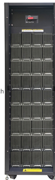
X90-BC Battery Cabinet