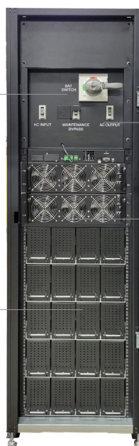
X90-2S 100kW UPS (door removed)

Battery Module includes 10 pieces of 12V 580W batteries