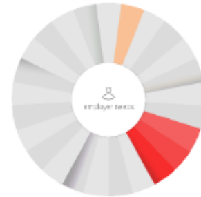
From Technology Companies

Break away from the mold of the traditional broker. The average broker meets your basic needs when it comes to claims, plans and renewal negotiation. What about open enrollment? New legislation? Department of Labor (DOL) compliance?