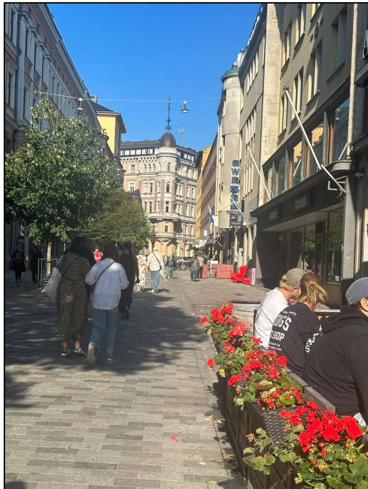
Street in Helsinki