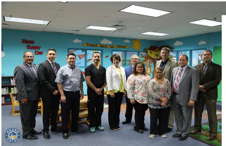
Pharr, Hidalgo County, Texas

The 2015 Texas Border Colonias Study of the Federal Reserve Bank of Dallas and subsequent community convenings revealed the impact of the digital divide in the border region.