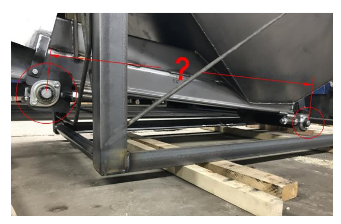
Chute End TO Motor End