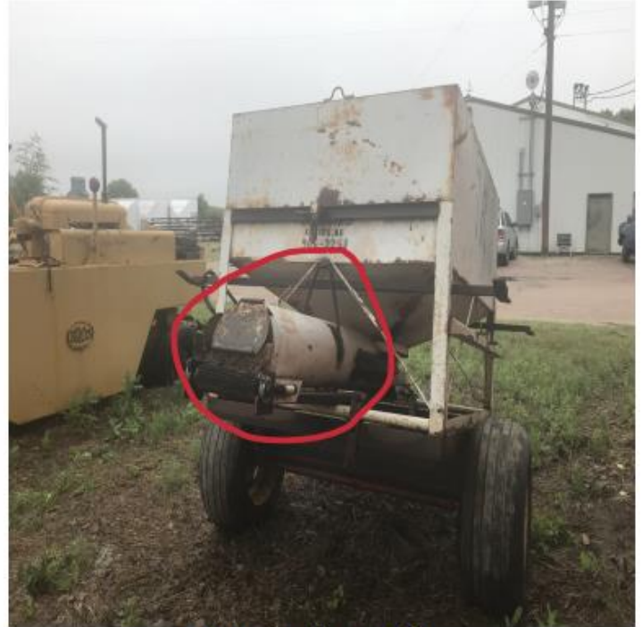
Round Tube Feeder