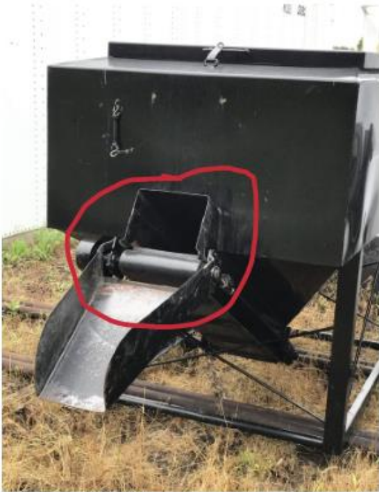
Square Tube Feeder