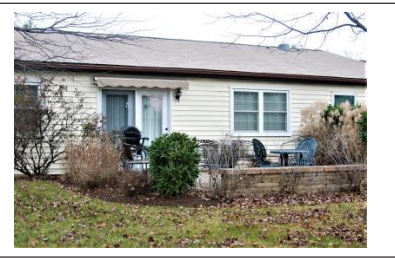
6897 Buttonwood Court Great price of $398,500 The one you have been waiting for – A Newberry, detached home w/den! But not your standard one. Sellers added an appr. 100SF addition extending rear bedroom & adding an ensuite bath. Also, the kitchen was completely remodeled, including new cabinets. Plus they made the wall into the Dining Room a knee wall making a bright open floorplan. Many updates include windows, atrium door, heat pump, some wood floors, stone front & more! Enjoy your morning coffee on your patio. This is a one of a kind!