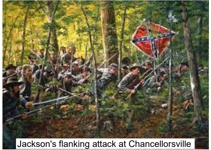
Jackson's flanking attack at Chancellorsville