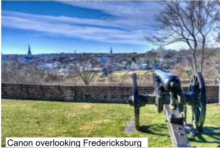
Canon overlooking Fredericksburg