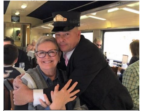
The conductor came through the car to welcome us.