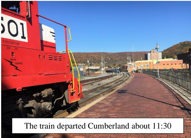
The train departed Cumberland about 11:30

A server took our prepaid lunch orders and offered us beer, wine, and soft drinks (extra) to complement our lunch along with the included ice water and iced tea. All of the lunch choices were tasty and well prepared; no complaints here. A narrator gave us a running description of the area as the train left Cumberland on its roundtrip to Frostburg.