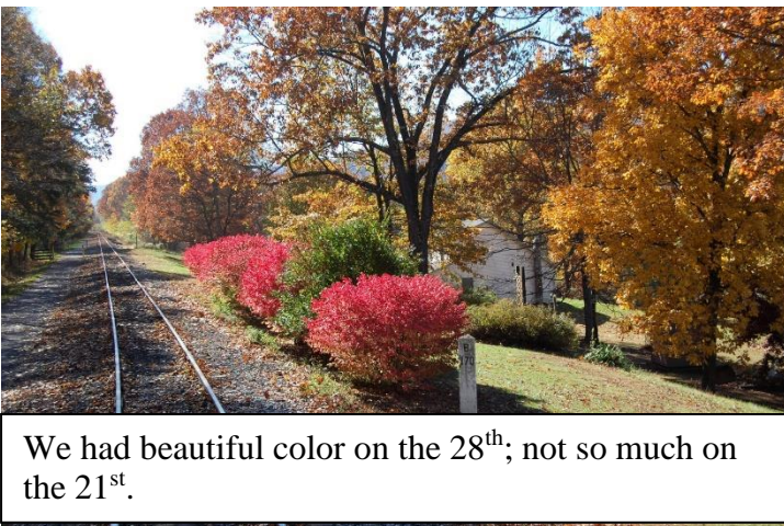
We had beautiful color on the 28 th ; not so much on the 21 st .