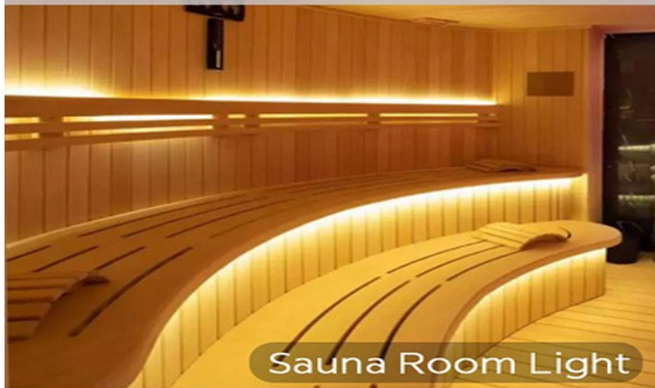
Sauna Room Light