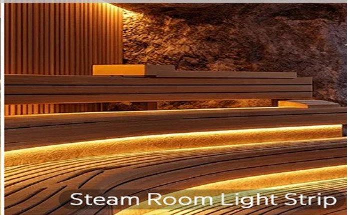
Steam Room Light Strip