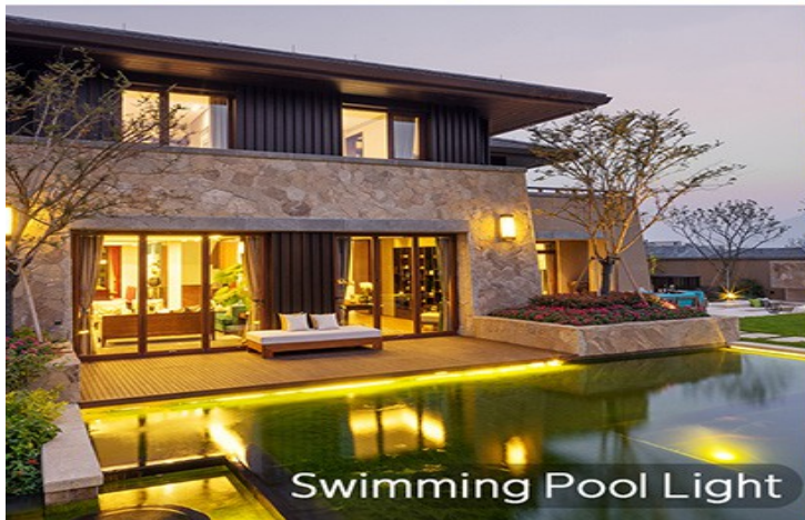
Swimming Pool Light