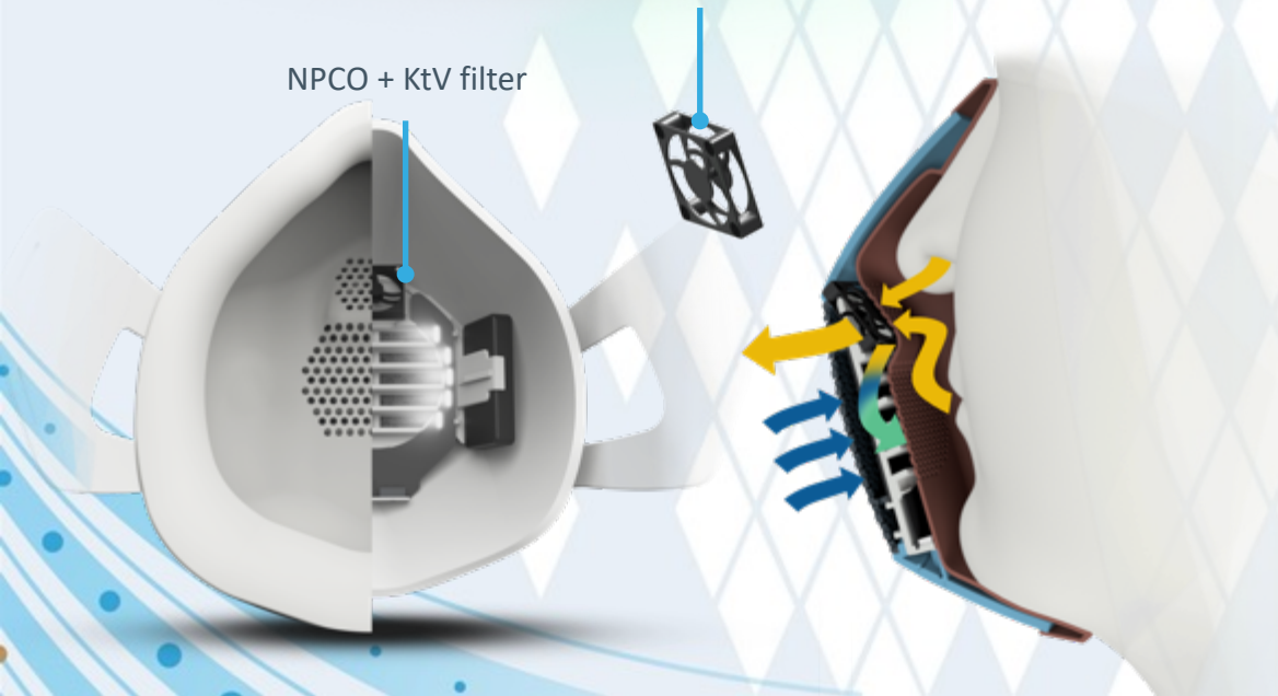
NPCO + KtV filter