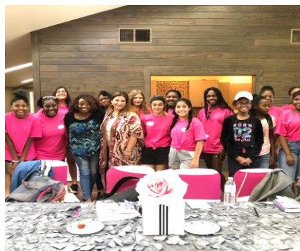
Teen Conference 2018

many challenges during their middle school to high school years. Trying to fit in socially, economically, and even intellectually is the center of their era. It is proven that the most crucial time of a child during their adolescent years. The teen ministry gives them a platform to share the challenges they face without fear of being judged