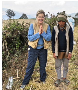
Daughter Follows Mom - Everest