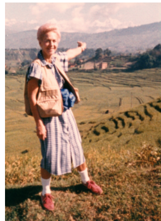
Mom Climbs in Her 50s - Everest