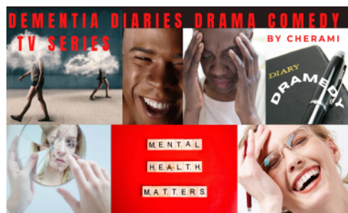
Healing with Humor! Raise Awareness