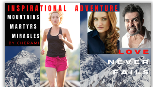
Escape To Everest Drama (BIOPIC) – Feature Film