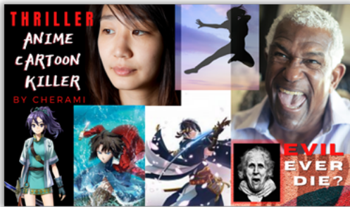
They Dwell Among Us Animation Thriller – Feature Film