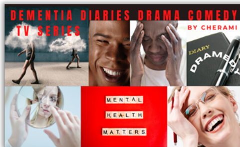
Dementia Diaries Dramedy – TV Episodic Series