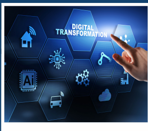
TRAINING & LEARNING DEVELOPMENT