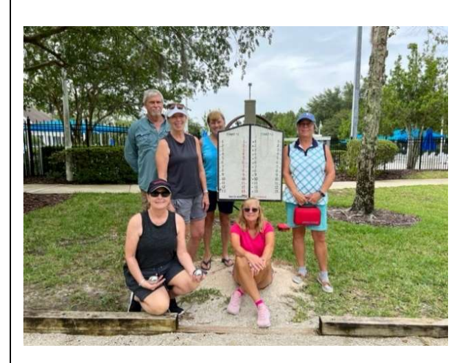
Petanque Crew Come join us Wednesday August 16<sup>th</sup> at the North Hampton Petanque Courts