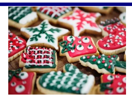
Holiday Cookie Sale

The Women of Nassau are going to exhibit their talents by holding a Holiday Cookie Sale at the November luncheon. Members of the organization are baking cookies with a holiday theme for sale. Cookies will be packaged in amounts of around a dozen and offered for sale to all members and attendees at the November luncheon. The price will be reasonable and well worth it for the fantastic cookies you will purchase to share with your family or at holiday gatherings. This is a fundraiser for our Ways and Means group.