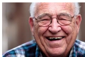
Elizabeth, Elsmere, Delaware

"Paying off credit cards isn't just about money; it's a step towards freedom. It's not just about numbers; it's about reclaiming control and building a future free from debt's burdens. The advantage lies in the empowerment and peace of mind gained, a journey towards a debt-free horizon."