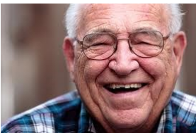
Elizabeth, Elsmere, Delaware

"Paying off credit cards isn't just about money; it's a step towards freedom. It's not just about numbers; it's about reclaiming control and building a future free from debt's burdens. The advantage lies in the empowerment and peace of mind gained, a journey towards a debt-free horizon."