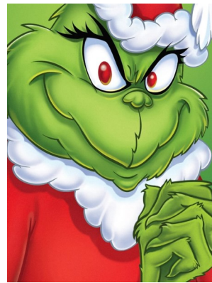
The Grinch Advocate for 2nd Chances Mount Crumpit, Whoville