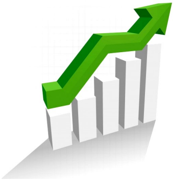
State Budget Growing!

How Can We Fund More Education, Health Care, Food & Housing as Our Economy Declines?