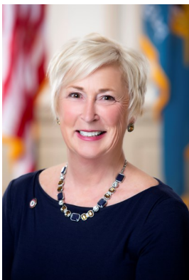
Ruth Briggs King Candidate Lt. Governor