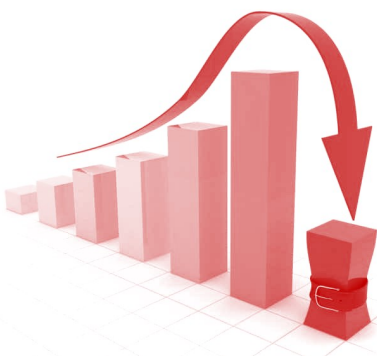
State Revenues Slowing!