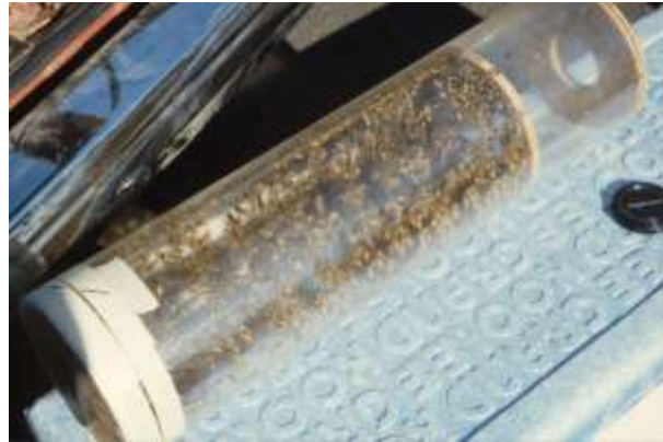
Above, Carl's vacuum (left); a tube full of yellowjackets (right)

Venom: The chemical composition of yellowjacket venom is a complex mix of proteins and organic acids. Each species' venom has a slightly different composition from others'. Meenu Singh and others have done extensive work with the venom chemistry. Gary Stelzner asked whether mud daubers sting; Carl said that they do, but they sting to paralyze prey, so it is not the same irritating hurt – mud dauber venom is designed for insects, not for vertebrates, and is mainly used to paralyze spiders.