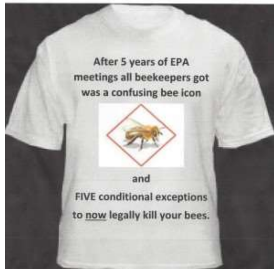
Above left, EPA’s new neonicotinoid warning label’s bee image; at right, Pollinator Stewardship Council’s visual commentary

The Pollinator Stewardship Council charges that the label’s bee image (see above) could just as easily be taken to imply that a product is “bee safe” as “bee dangerous.” PSC criticizes EPA’s five exceptions to the “do not apply” restriction: first, “the application is made to the target site after sunset”; second, “the application is made to the target site when temperatures are below 55 degrees Fahrenheit”; third, “the application is made in accordance with a government-initiated public health response”; fourth, “the application is made in accordance with an active state-