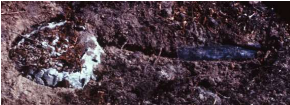
Above: just say no to pouring gasoline into openings to ground nests. . . .

Eradication Do's and Don't's: Carl argued against using gasoline to eradicate a hive whose opening can be seen (see below). The gasoline chemically plugs that tunnel, and the yellowjackets will just dig a new tunnel – but with a very hostile attitude. The Extension brochure suggests non-chemical interventions, which are the best way to deal with them when they arrive uninvited at your barbeque. Carl thinks that the western yellowjacket, not the bald faced hornet, has the shortest fuse: “they’ll crawl into your pants legs, and - it’s bad.” The nest above, displaying a very tight scallop pattern, is also unusual because usually the common yellowjacket is a cavity dweller: however, this colony, living under a deck, didn’t read the textbooks.