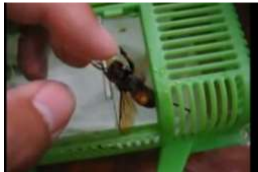
Above left: yellowjacket nest after being riddled with .22 caliber bullets; right, vespa ducalis hornet compared with human fingers.