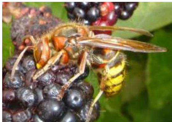
Above, Vespa crabro : a.k.a. “hornet.”

https://www.youtube.com/watch?v=zPiK_071rmg . Though technically an aerial wasp, they can be found in some odd locations, such as a food dehydrator on one's back porch. On hot days, they will cluster around the opening of their nest and fan as bees do. To see how they react when their nest is pounded upon, visit: https://www.youtube.com/watch?v=bofEUv6ZYH4 .