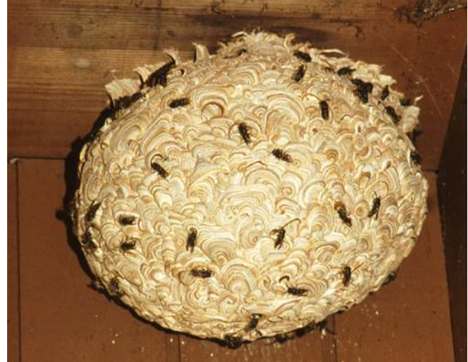
Above left, cross-section of yellowjacket brood from an exposed nest built into a chair; at right, classic common yellowjacket nest shows characteristic, tightly scalloped pattern.

Carl showed a remarkable series of photos of typical nests. Vespula pensylvanica , the western yellowjacket (above, right), is the type that tries to eat from your plate during a picnic. Note the scalloping that is the definitive feature of these nests.