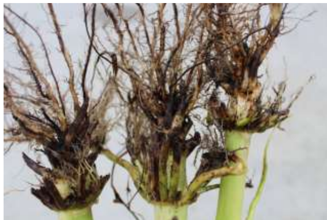
Monsanto is also exploring RNA interference to kill rootworm damaging corn

The Times reports that "Monsanto is also looking at putting RNA into sugar water fed to honeybees to protect them from the varroa mite. . . If the RNAi is directed at a genetic sequence unique to the mite, the bees would not be harmed by ingesting it, while the mites would be killed once they attacked the bees. One field trial showed that this technique could help protect bees from a virus. Monsanto acquired Beologics, a company developing the RNAi technology for bees." To read more, visit: http://www.nytimes.com/2014/01/28/business/energy-environment/genetic-weapon-against-insects-raises-hope-and-fear-in-farming.html?emc=eta1 .