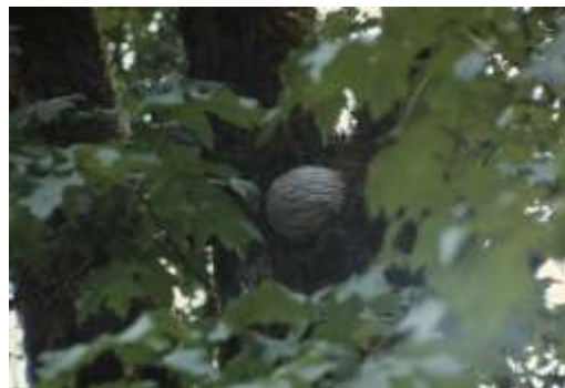
Above left, a yellowjacket nest “in nature”; at right, a rare Dolichovespula norvegicoides nest.